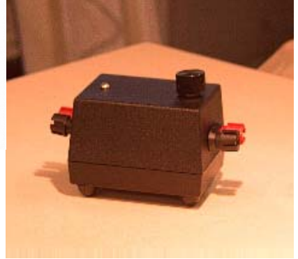
Gizmo shown for one channel