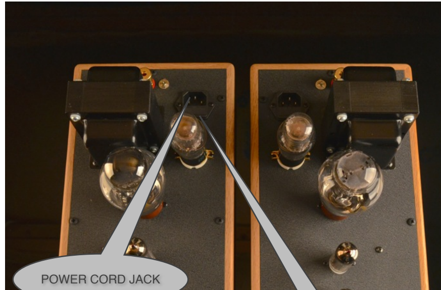
POWER CORD JACK